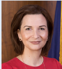
Keynote Address by FDIC Chair Jelena McWilliams